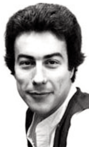
Student life ...