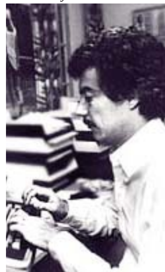
The write stuff