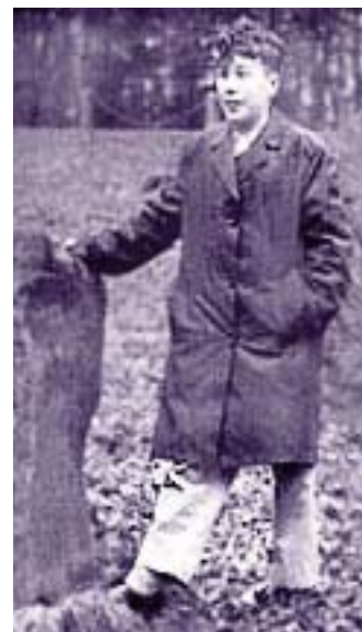
As a schoolboy in Wales

"I was very worried that I might not be able to do it again. It happens to quite a lot of writers. They write one terrific book and then the next one is not so good and doesn't sell quite so well, the third one is not very good and they never write a fourth. I was conscious that might easily happen to me, and so I worked very hard on Triple to try to make it as exciting as Eye of the Needle ."