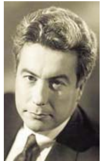
The first best-seller

Ken's latest novel is a 'prequel' to 'Pillars'. The Evening and the Morning takes place around the year 1000, when England is under constant attack from Vikings and soon to be conquered by Normans. The theme of the story is the origins of a legal system that does not merely serve the ruling chieftains, but where disputes are settled according to rules. The story is set at the end of the Dark Ages and the beginning of the Middle Ages, so it's an evening and a morning.