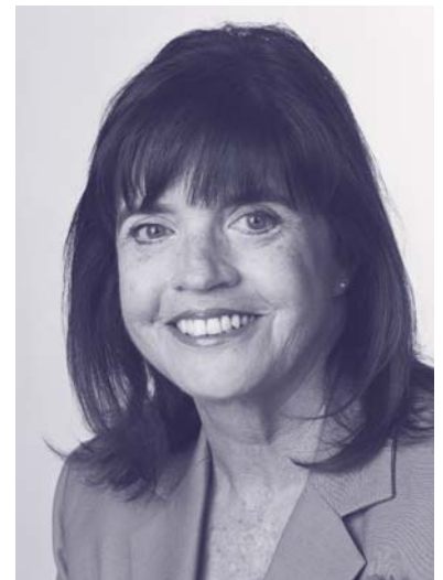
Barbara Follett MP