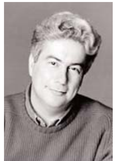
An accomplished novelist