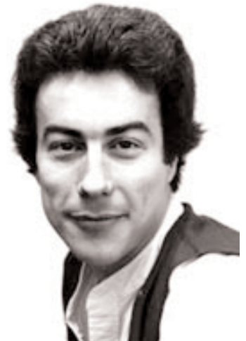
Student life ...