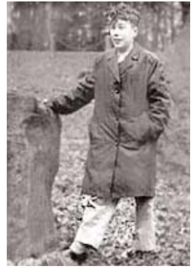
As a schoolboy in Wales

In September 1970, fresh out of university, a three-month graduate journalism course set him on a writer's path. He began as a reporter for the South Wales Echo in Cardiff, and then, following the birth of daughter Marie-Claire in 1973, as a columnist for the Evening News in London. When he did not "make the grade as the hot-shot investigative reporter" he'd imagined he might be, Ken started writing fiction at night and on weekends. In 1974 he left newspapers and joined a small London publisher, Everest Books.