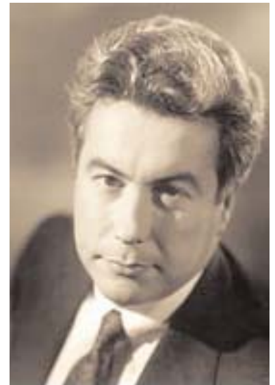
The first best-seller

He then surprised readers by radically changing course with The Pillars of the Earth (1989), a novel about building a cathedral in the Middle Ages. It received rave reviews and was on the New York Times best-seller list for 18 weeks. It also topped best-seller lists in Canada, Britain and Italy, and was on the German best-seller list for six years. The next three novels, Night Over Water (1991), A Dangerous Fortune (1993) and A Place Called Freedom (1995) were more suspense than thriller, but he returned to the thriller genre with The Third Twin (1996) which in the Publishing Trends annual survey of international fiction best-sellers for 1997 was ranked No. 2 worldwide, after John