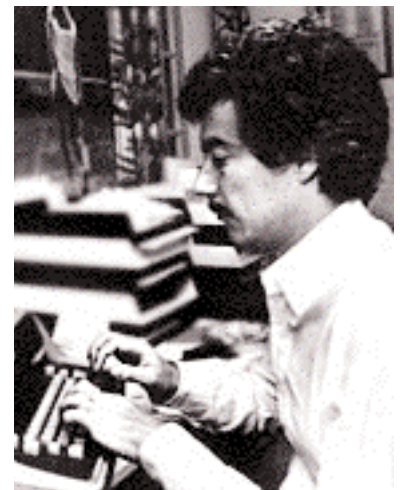
The write stuff